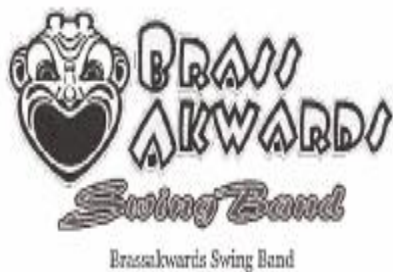
July 21 - Brassakwards 7:00 pm Lively Swing Band!