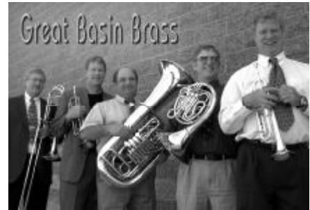
July 16 - Great Basin Brass 7:00 pm Humor and Energy!