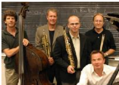
July 9 - The Collective 7:00 pm UNR's Best Jazz