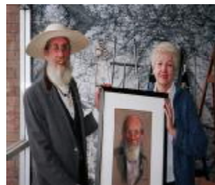
Latimer Art Club Exhibit

Please see complete FUMC Artown schedule on back of the July Calendar