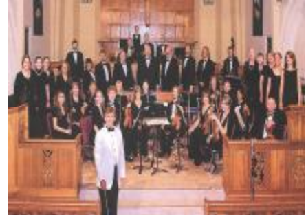
July 7 - Toccata Chorus/Orchestra - 7:00 Red, White & Blue