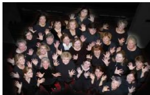
July 23 - Bella Voce 7:00 pm Songs from the 20's and 30's