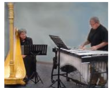
July 28 - Harp & Vibes 7:00 pm Bach to Basie!