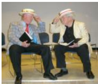
Ageless Repertory Theater