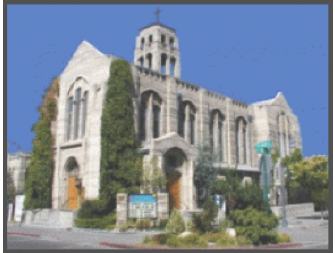
First United Methodist Church